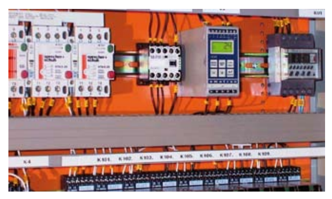
Drainage control with an Emotron DCM is easy and cost-efficient. No need to worry about snoring pumps or blocked sensors.

Emotron DCM technology can also be used in dual-pump systems. Two control units are used to monitor two submersible pumps that run alternately, for example in sewage treatment and water purification plants. This master/slave solution offers high reliability. If a problem occurs with one pump, the control unit automatically starts the other pump, preventing unnecessary downtime.